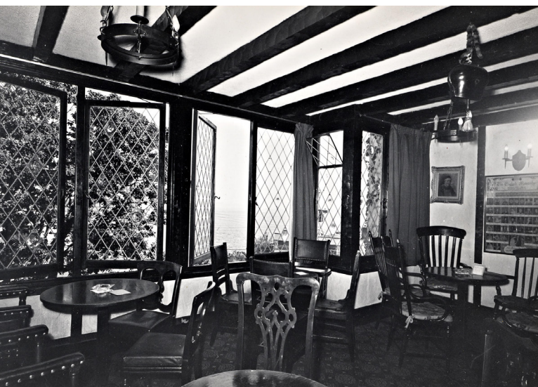
Images of the original Snug, circa 1940.

Our guests love The Snug, and our amazing local community continues to flock to this legendary watering hole.